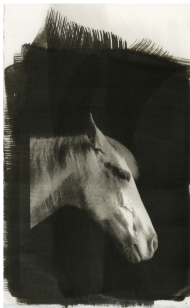
Milo Fay , Pale Face , 2010. Palladium/Platinum print. 19" x 13".