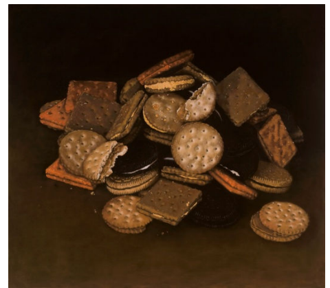
Soojin Kim , Sandwich Crackers , 2010. Oil on canvas. 54" x 60".