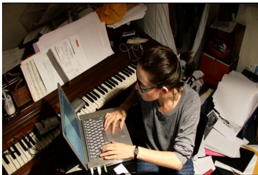
Atsuko Ito , 440 (still) , 2010. 30 minute video.