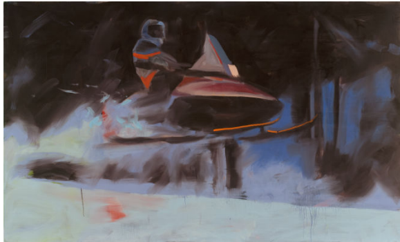
Taylor Butler , G-Storm , 2010. Oil on canvas. 49" x 73". Courtesy of the artist.