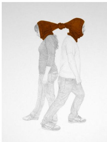
Andrea Evans, Reverse Double Balaclava #2 (detail) , 2008. Graphite and watercolor on paper. 22x22 inches.