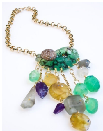
Drift Collection, 2009, Resin Geode Chandelier necklace with assorted resin beach glass stones. Courtesy of Triian: Modern Era Gems.