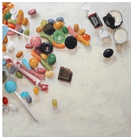
Soojin Kim, Candies , 2009. Oil on canvas. 46x48 inches.