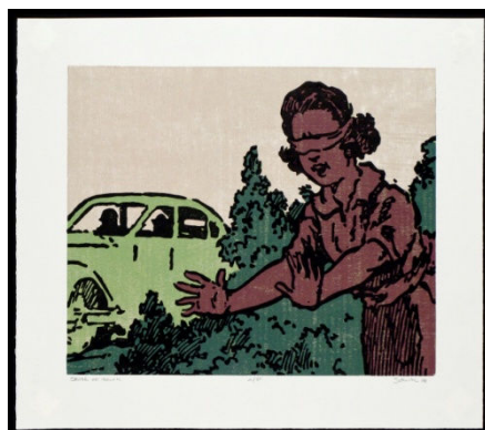
John Schulz, BlindFoldGirl (Sense of Touch) , 2008. Color wood cut. 19x21 1/2 inches.