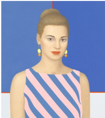
Ridley Howard, Blues and Pink , 2012. Oil on linen. 16x18 inches. Neumann Family Collection.

MFA presents first solo exhibition of a Traveling Fellow from the School of the Museum of Fine Arts