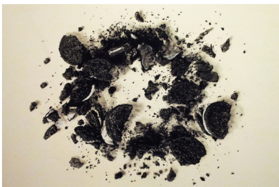
Soojin Kim, Cracked Oreos , 2012. Conte crayon on paper. 95x120 inches. Courtesy of the artist and Tao Water Gallery.