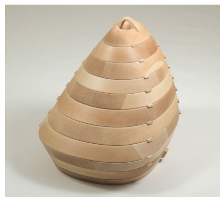
Greg Menceff, My Weight , 2010. Basswood. 21x24x18 inches.