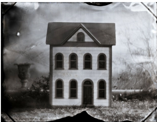
Milo Fay, 18 James Street , 2012. Digital print on silk. 36 ½ x 31 ½ inches.

For high-resolution images, call 617-369-3605 or email bdaniels@smfa.edu .