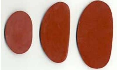
1 Steel Scraper-Ovoid