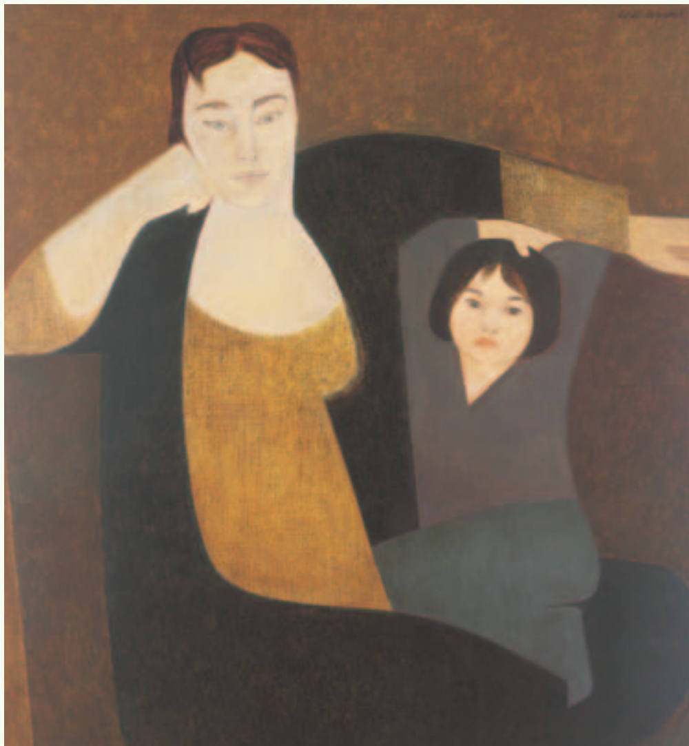
Will Barnet, Mother and Child, 1961. Oil on canvas, 46 x 39 inches.