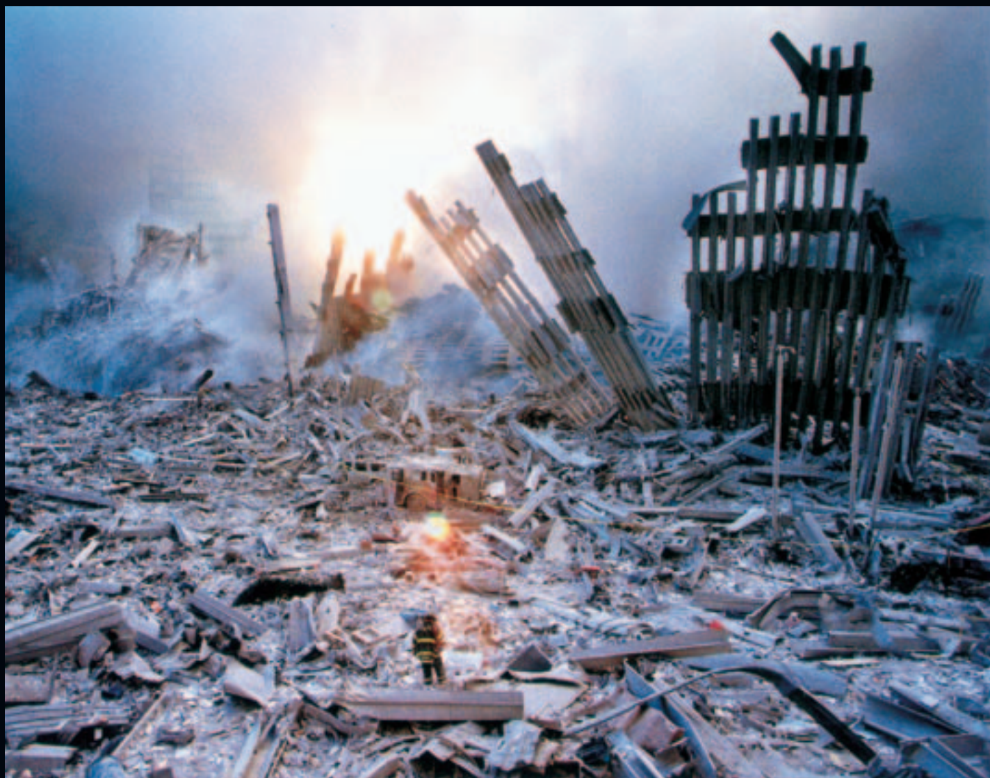
Jim MacMillan, First Light 09/12/01, 2001. Color print, 26 x 39 inches.

Photographers and their view of the world around us