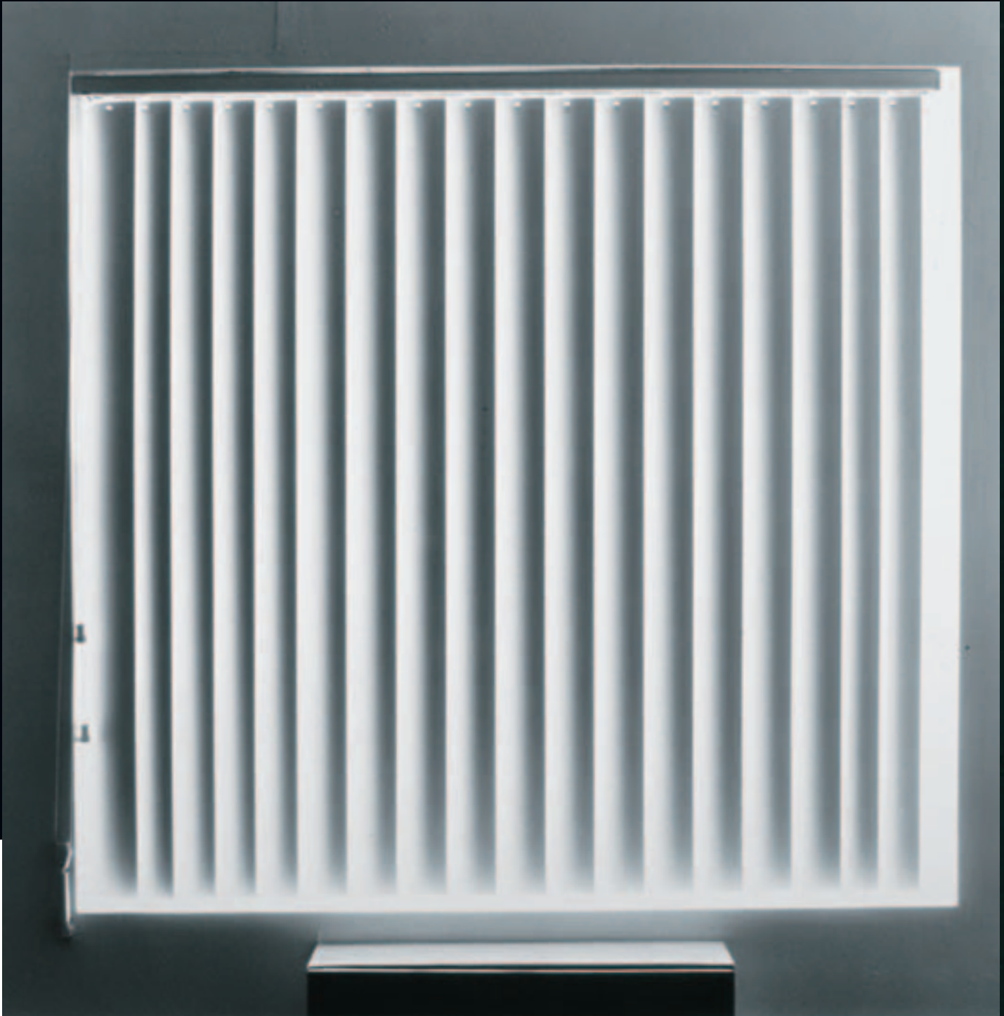
Neeta Madahar, Bedroom Blinds , 2001. Type C print, 15 x 15 inches.