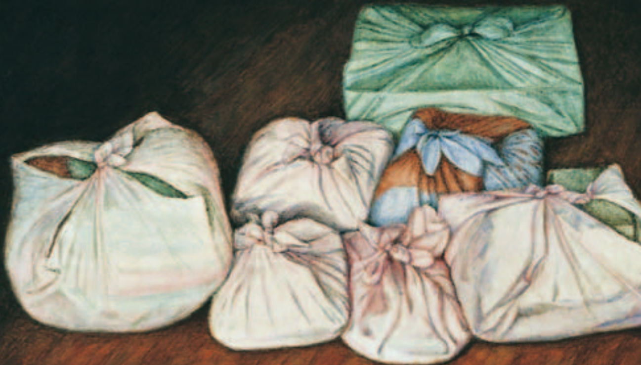
Chung-Shil Adams, I need to empty my room, 2003. Egg tempera on panel, 9 x 11 inches.