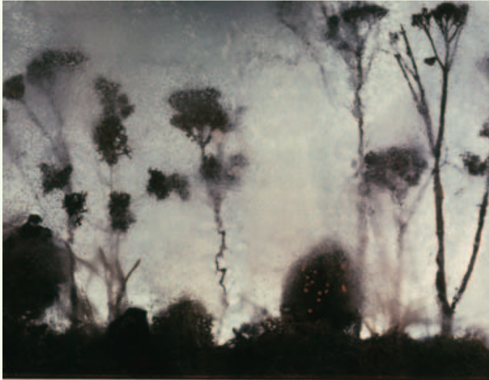
Judy Haberl, Iced Fiction Series: Stilled Garden (detail), 2001. Frozen landscape Polaroid, 40 x 96 inches.

Harriet Zabusky-Zand (Dip '84) had pieces from her Dressed to Kill series included in an international paper show at Monique Goldstein Gallery in New York, NY, and her new paintings of water were featured at Cotuit (MA) Center for the Arts. The Mandarin Hotels recently purchased pastel drawings and a large painting for their new Columbus Circle (New York) hotel.