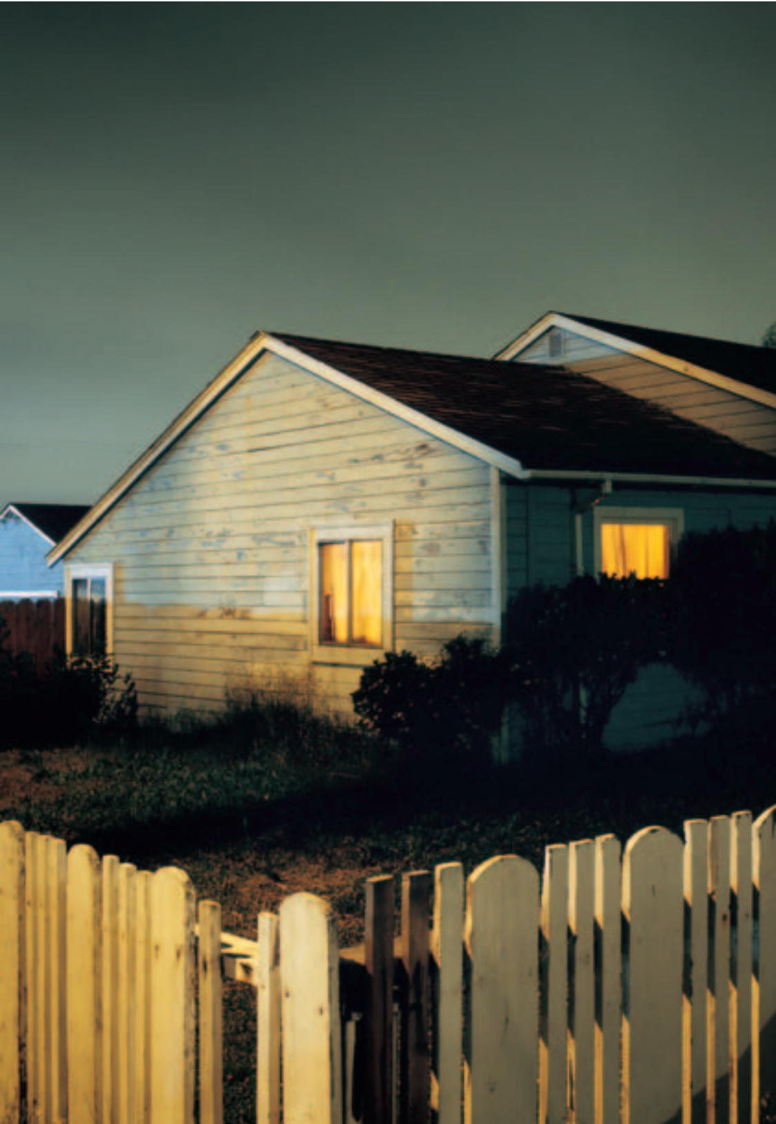
Todd Hido, #2690 (detail), from the series House Hunting , 2001. Chromogenic print, 30 x 38 inches.

I drive and drive and I mostly don't find anything that is interesting to me. But then, something calls out. Sometimes there is the smallest thing that catches my eye.