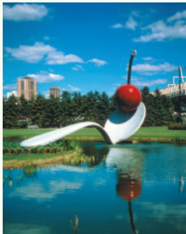
Claes Oldenburg and Coosje van Bruggen, Spoonbridge and Cherry , 1985-88. Stainless steel and aluminum painted with polyurethane enamel, 29 x 51 x 13 feet. Minneapolis Sculpture Garden, Walker Art Center, Minneapolis, MN.

The Medal Award is endowed through the generosity of Carol and Arnold Haynes.